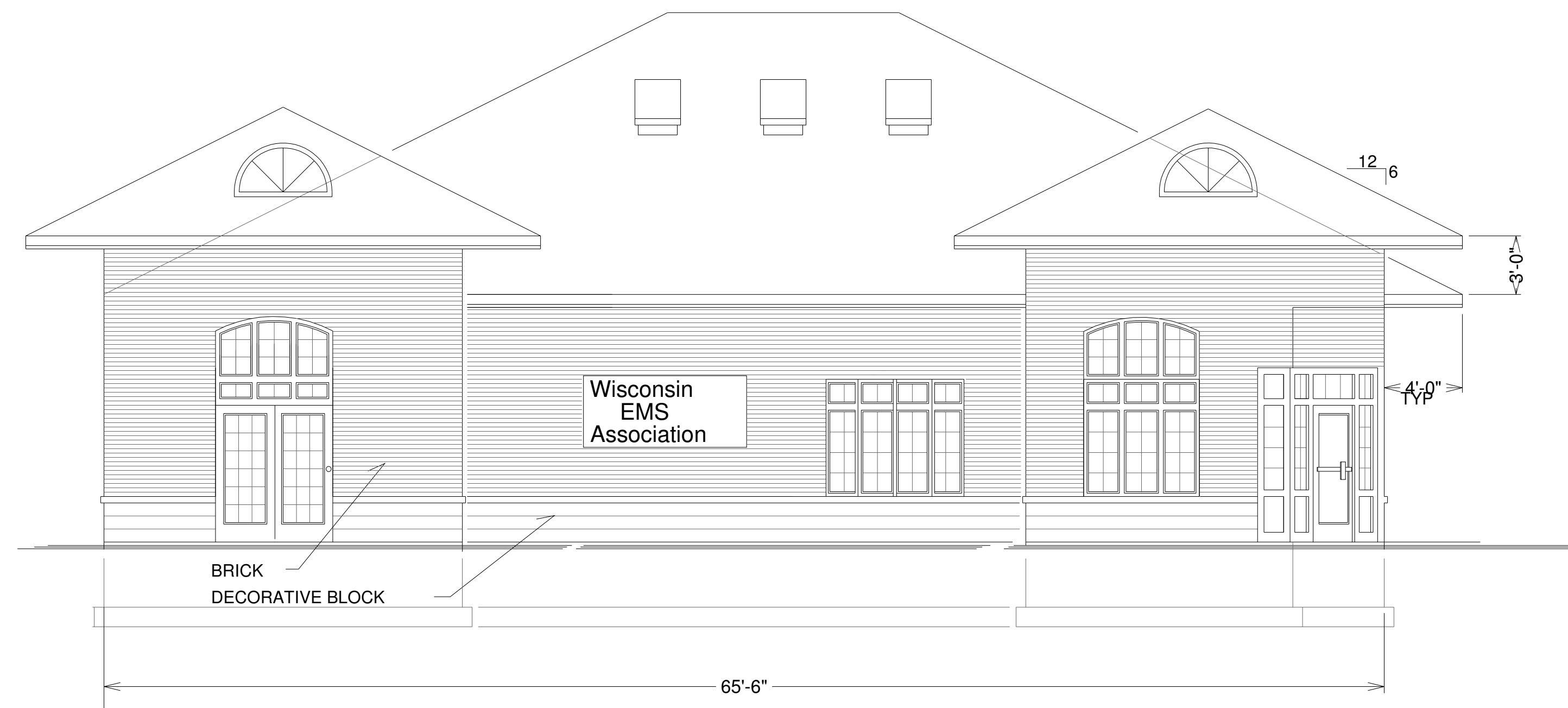
° SOUTH ELEVATION 3/16"=1'-0"